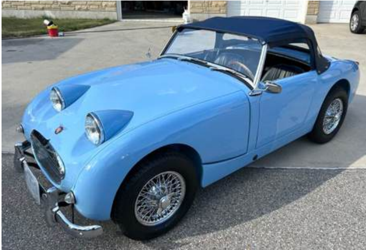
1960 Austin Healey Bugeye Sprite Asking: $55,000.00

This is an unmatched opportunity to own a piece of Austin Healey history with all the bells and whistles, restored to exacting standards and carefully stored in a climate controlled garage since restoration.