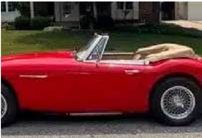
1967 AUSTIN HEALEY BJ8 $89,000 CDN

Please contact Scott for more details: murrayscott598@gmail.com