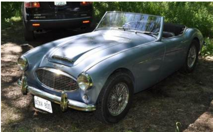
Austin Healey BT7 Asking: $34,500.00 **new price