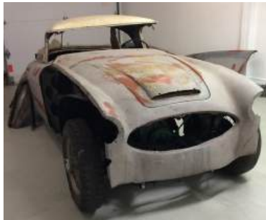
1960 Austin Healey BT7 - MK1 $21,650.00 CDN - Located in Montreal area

PROVIDED AS A COURTESY TO OUR MEMBERS. MEMBERS ARE REMINDED TO USE CAUTION WHEN DEALING WITH SOMEONE YOU DON'T KNOW. THE AHSCO TAKES NO RESPONSIBILITY FOR THE ACCURACY OF THE ADS