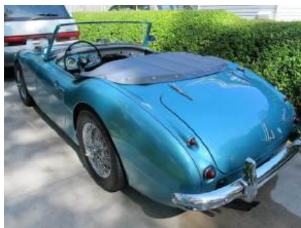
1967 AUSTIN HEALEY BJ8 $89,000 CDN

Early production model with gallery/Longbridge cylinder head. Overdrive. Fibreglass fenders. Older frame up restoration with custom paint. Monochromatic grey interior from Heritage Upholstery. Wilton Wool carpets with floor mats. Grey tonneau cover from Heritage No convertible top. Side curtains provided. Lucas Fog Ranger fog lights - 48 spoke Dayton wire wheels. Side rear view mirrors - Petronix electronic ignition. Stainless steel gas tank - Front disc brake conversion. New braided brake lines. New rear wheel cylinders. All fluids changed. j Additional engine block and cylinder head. Always garaged and covered during its life. Beautiful condition. A one of a kind vehicle. Please contact Paul at: dylewski@sympatico.ca