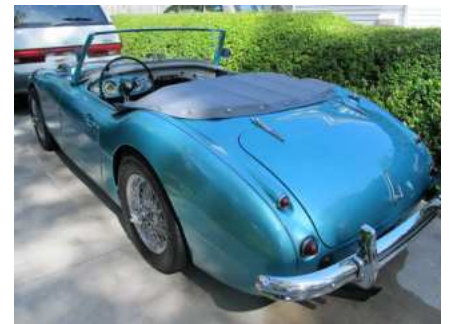
1967 AUSTIN HEALEY BJ8 $89,000 CDN

Please contact Paul at: dylewski@sympatico.ca