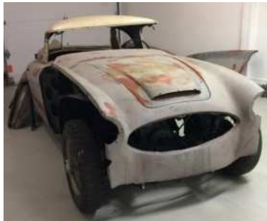
1960 Austin Healey BT7 - MK1 $21,650.00 CDN - Located in Montreal area

PROVIDED AS A COURTESY TO OUR MEMBERS. MEMBERS ARE REMINDED TO USE CAUTION WHEN DEALING WITH SOMEONE YOU DON'T KNOW. THE AHSCO TAKES NO RESPONSIBILITY FOR THE ACCURACY OF THE ADS