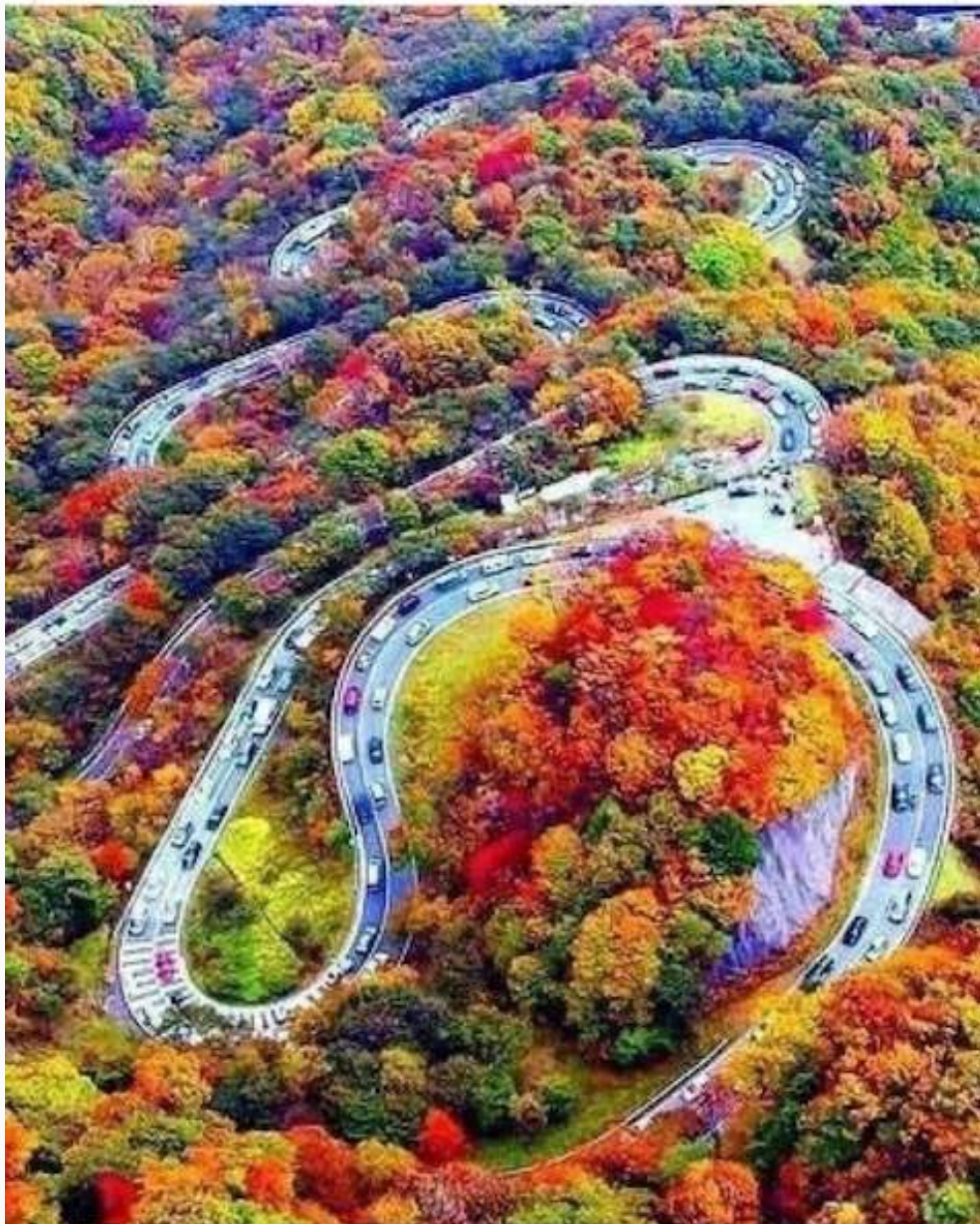
Tail of the Dragon. October 2023

A big highlight of the trip to SEC this year was the trip to Deal's Gap to drive the Tail of the Dragon. Check out this view from above!