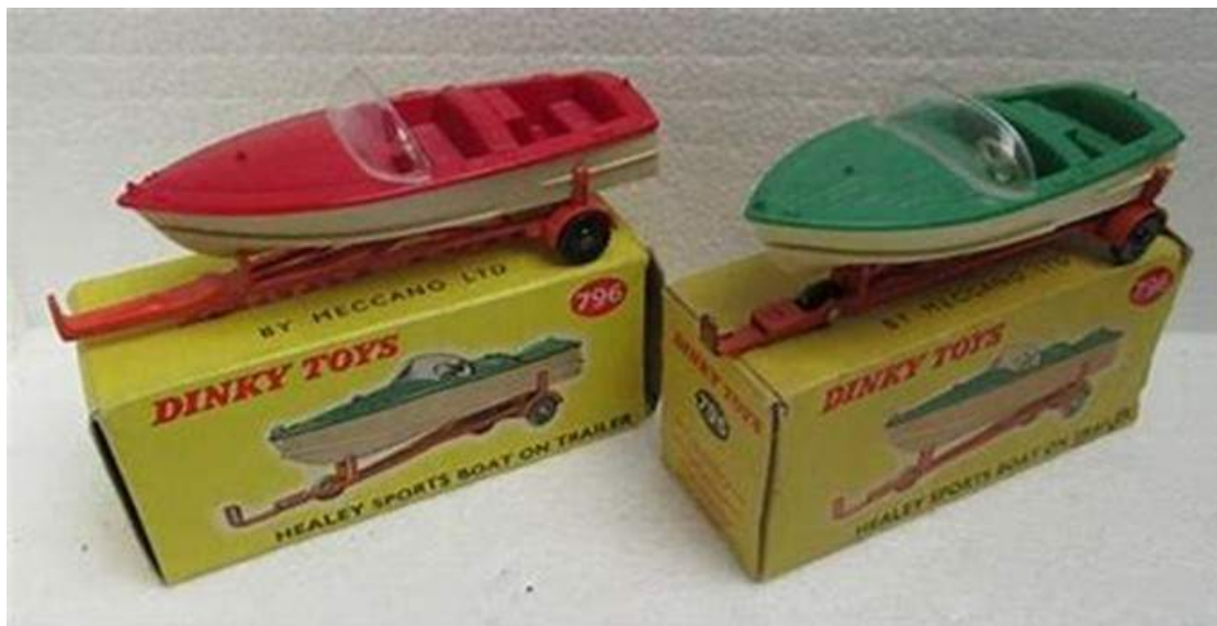
1960-1962 Healey Sport Boat Models on Trailers

Where: Via Zoom in the comfort of your own home