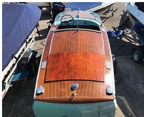
1959 Healey Model 75 Sports Boat