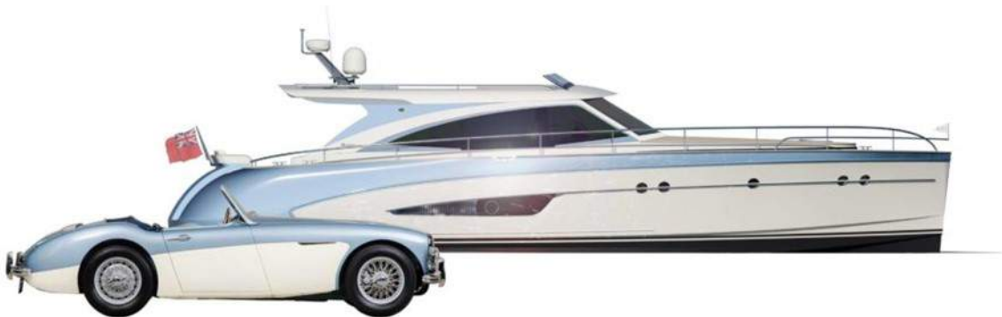
Mulder Healey 1800/60- Twin Volvo engines

The two-tone metallic blue and white color scheme is similar to the Austin Healey 100S; so is the small windshield on the cabin top that protects the captain and navigator when they're sitting up there. And the yacht's lines also are designed to be look like those on the sports car.