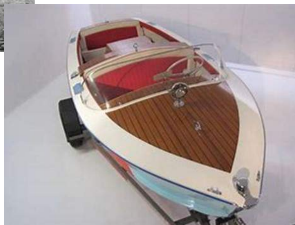
1957 Healey Marine 55 Sport Boat