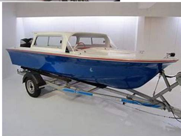
Healey Corvette Boat