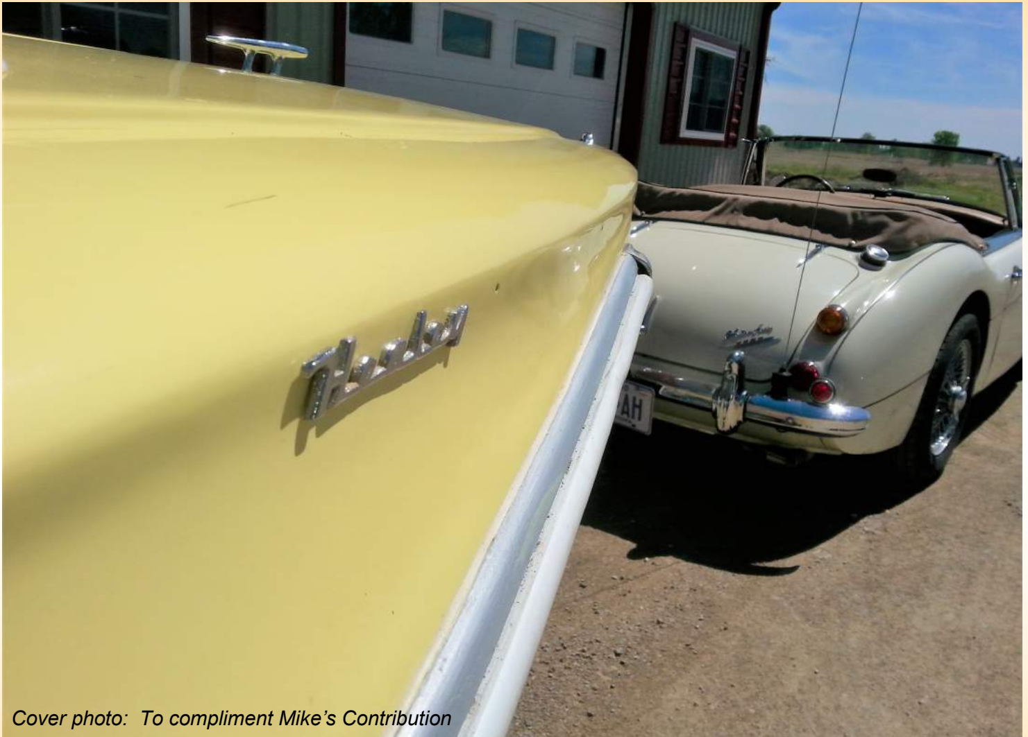
Cover photo: To compliment Mike's Contribution

We dedicate ourselves to the preservation of the marque through continued use, mutual enjoyment and sustained support.