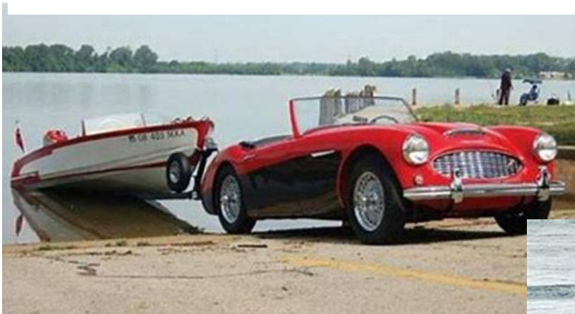
1959 100/6 and 1956 Healey Ski-Master 25 Runabout