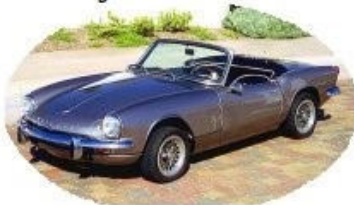
Introduced in 1962 and in production until 1980, over 314,000 Triumph Spitfires were sold

This year we showcase three British classics each 60 years young