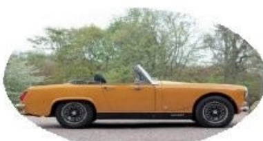
Introduced in 1961, the MG Midget sold 224,817 units before production ended in 1979