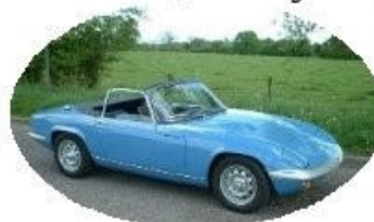
The Lotus Elan was produced from 1962 through 1973 with 12,224 cars reported

Brits is a Celebration of British Motoring Where Old Friends Meet and New Friends are Made