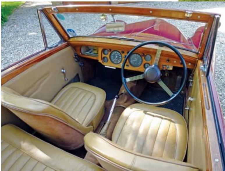
Details of the sumptuous interior in the Abbott.