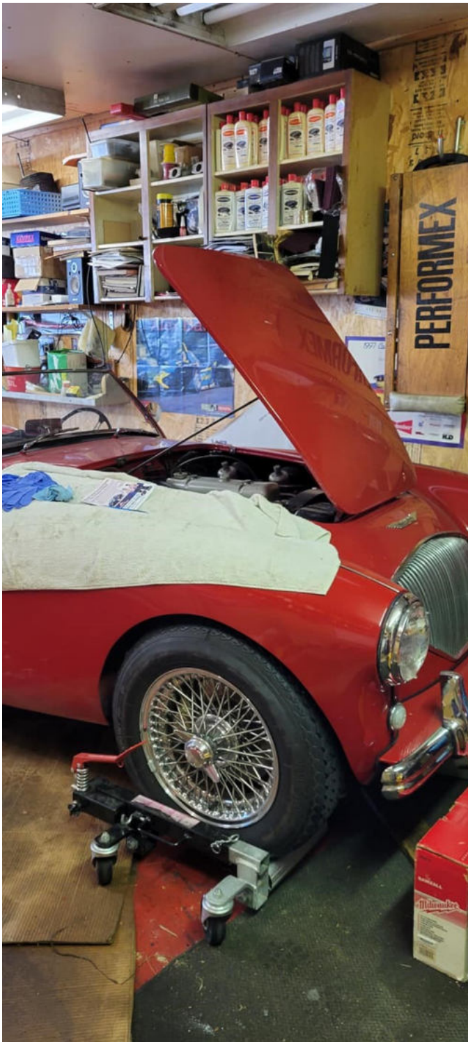
From the Doust stables