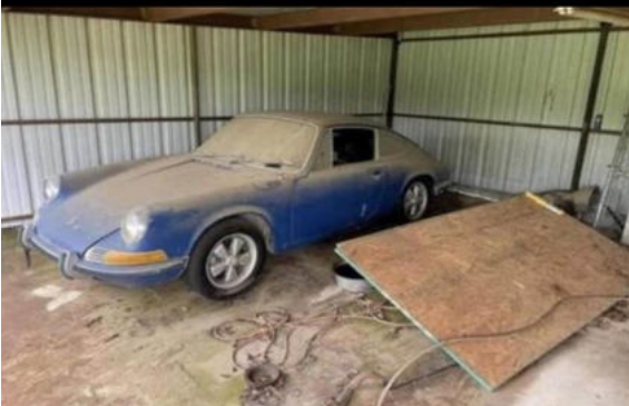
A "Funny" from Mike

UNBELIEVABLE! Man opens shed on newly acquired property and discovers a mint condition sheet of plywood