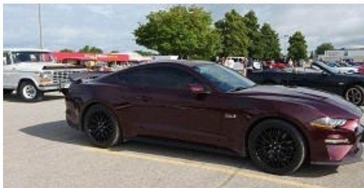
Our Rolling Car Show wheels—we had an extra passenger so a Healey wouldn't work that day!