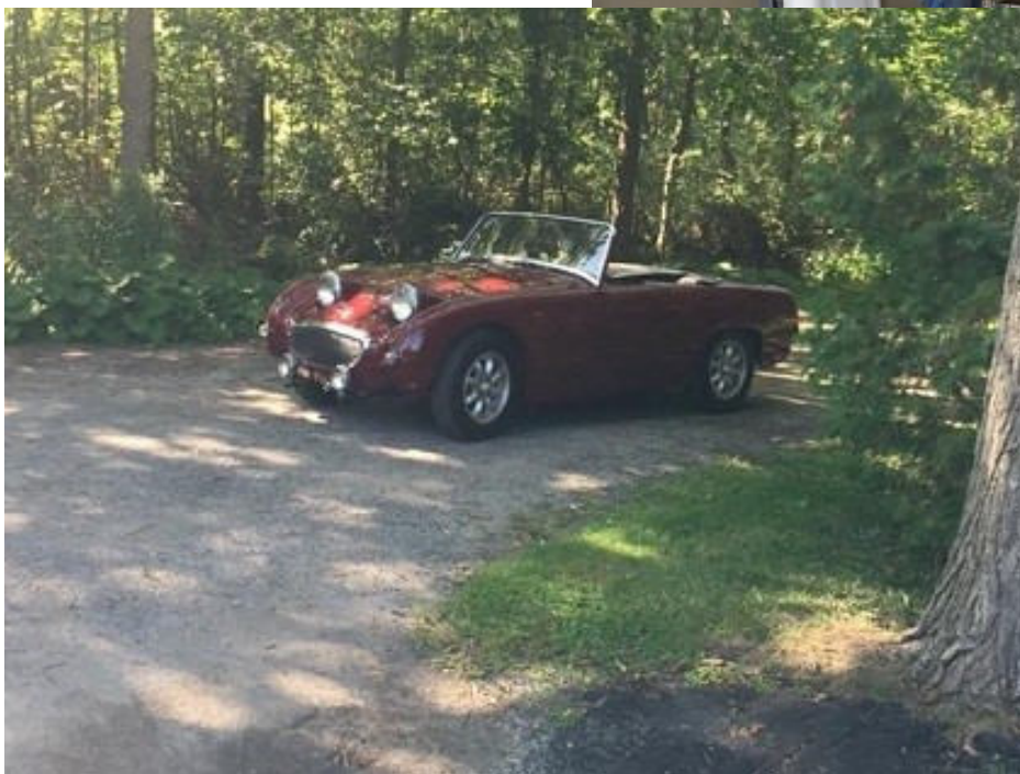
This lovely Bugeye picture.