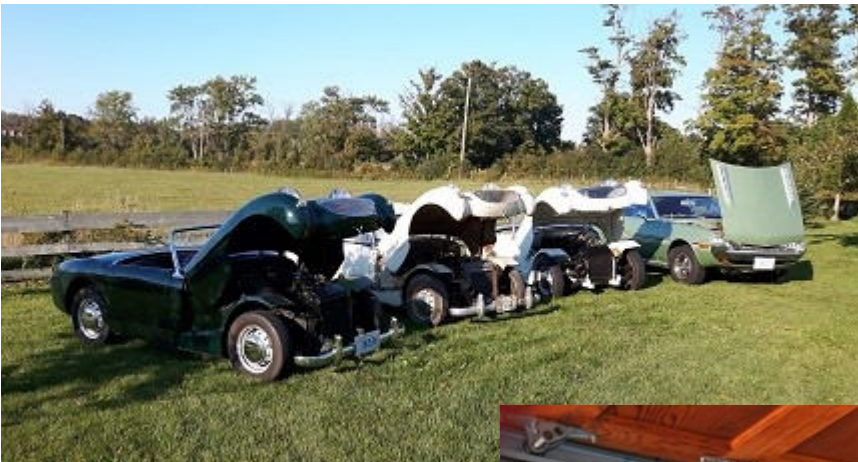
Bert & Mary-Lou Raposo sent in a selection of pictures of their collection of Bugeyes and Bert's prized Toyota.