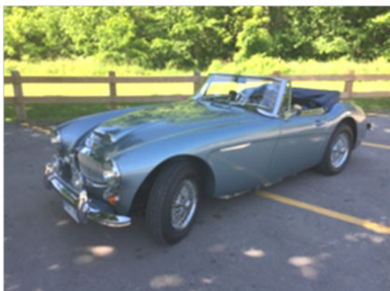
Mike's BJ8 photo for the Virtual Car Show