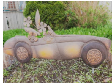
A couple of cool Healey finds we have come across.