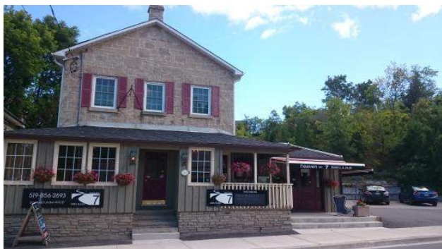
Heaven on 7