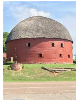
May 22 ^^ / 23

Elk City, OK is home to the Cotton Boll Motel and is now a private residence. But the sign still stands tall as the owners appreciated its significance. Also still operational is the 1931 Casa Grande Hotel, which hosted a Route 66 conference back in 1931 shortly after it opened. Also in the center of town is a 17 story drilling rig #114. Elk City also has storm shelter entrances that were originally built as a safe way for locals to cross the road back in the day when Route 66 was busy. Now with the new bypass highway, they have put these walkways to good use as storm shelters. Along the way we find more opportunities to drive on original parts of the old route, downed trees and all. It felt as though we were driving to the cottage.