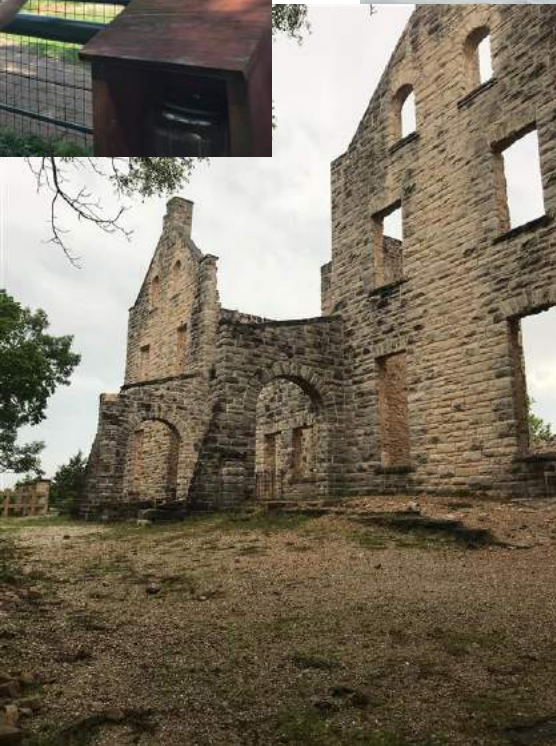
Ha Ha Tonka State Park >