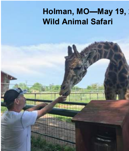
Holman, MO—May 19, 2018 Wild Animal Safari