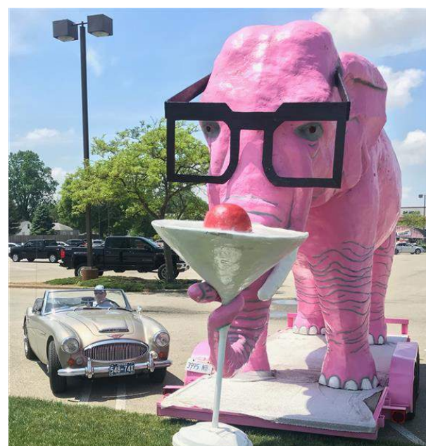
May 16, 2018