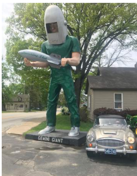
The Gemini Giant—May 15, 2018