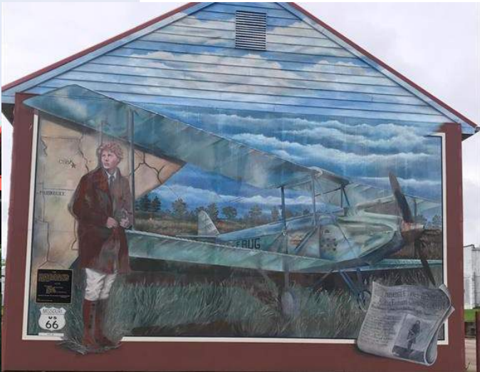
<Fanning, MO—May 18