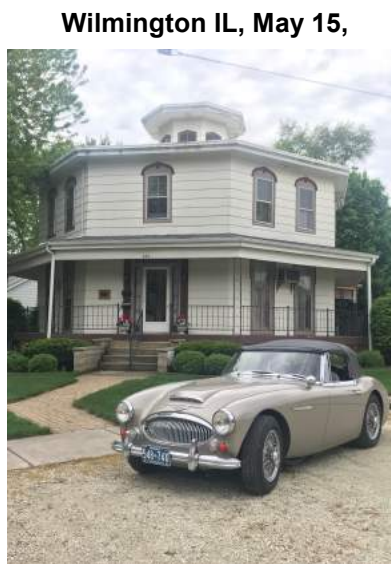
Wilmington IL, May 15,