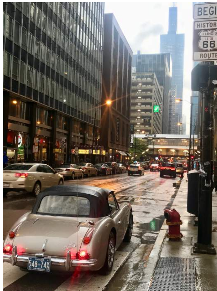
At the start of their great adventure—May 14, 2018