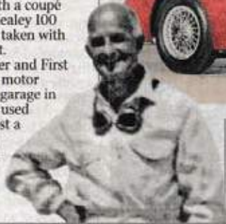
Donald Healey, who owned the company, liked the prototype so much he kept it for himself

The former rally driver and First World War pilot whose motor company grew out of a garage in Perranporth, Cornwall, used the two-seater for almost a decade before selling it in 1962 for £850 (about £17,000 in today's prices). A spokesman for Bonhams, the