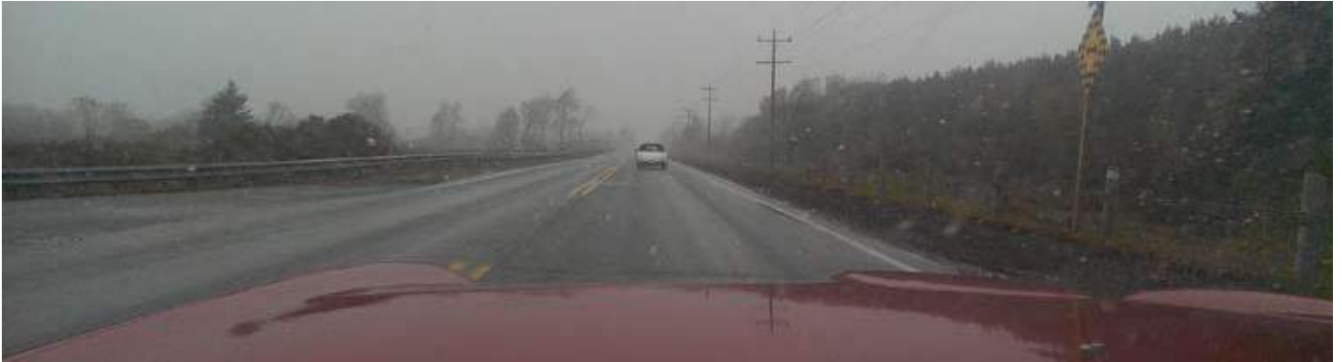
Snow streamer in the Hockley Valley left snow on the trees, ground and the windscreens of the cars. Never expected to be driving the JH in a snowstorm with the top down.