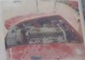
Under the hood of the Healey — familiar and comfy as an old baseball mitt to some, a distant foreign country to others.