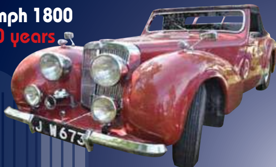
Triumph 1800 70 years