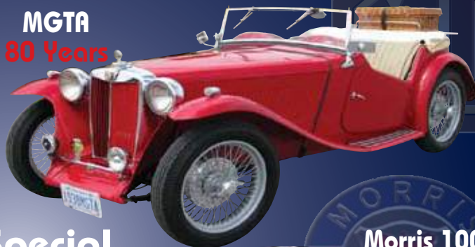
MGTA 80 Years