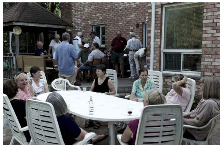
Before Dinner Social