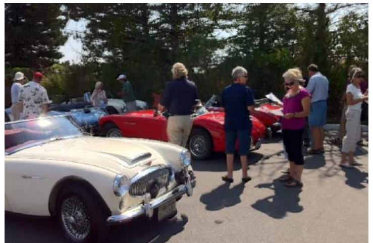
Tim Horton's before the drive