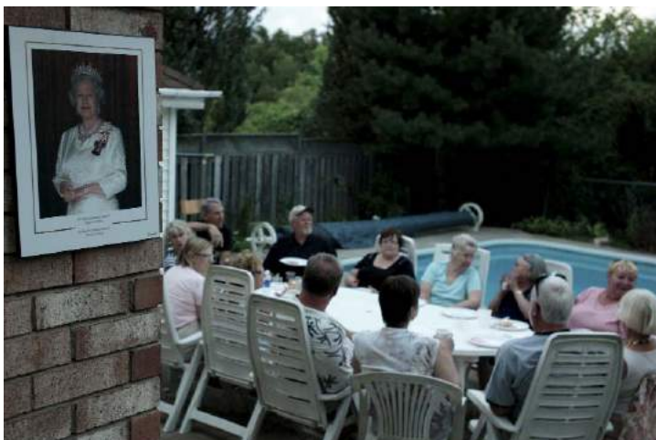
The Queen watching over us