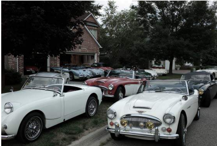
Cars in the Yard