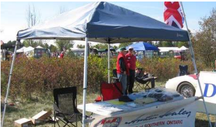
Our Healey booth at Bronte