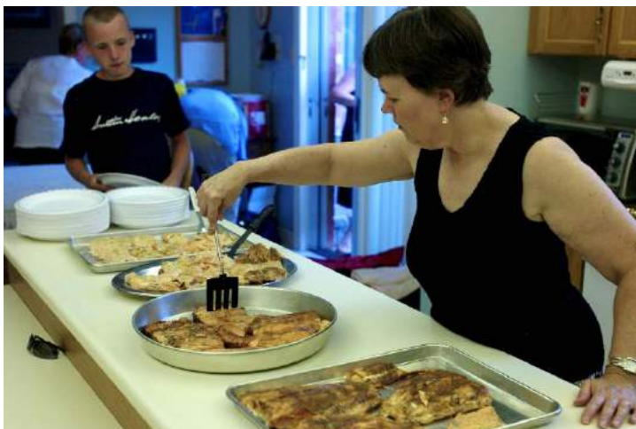
Dinner is ready