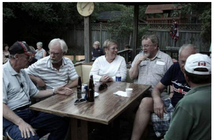
Good friends on a beautiful day