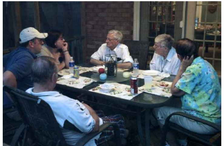
Dining in the Gazebo