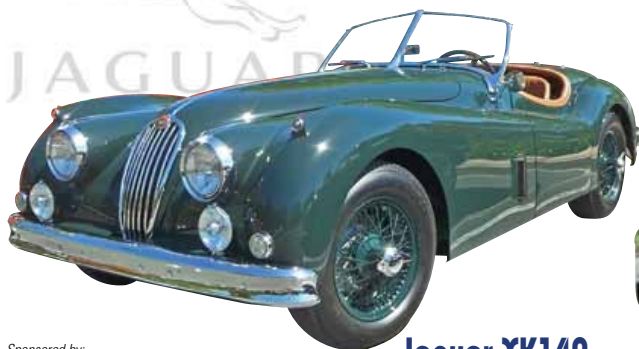
Jaguar XK140 60 Years