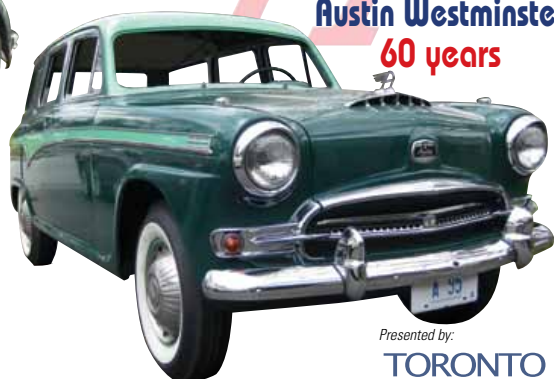
Austin Westminster 60 years