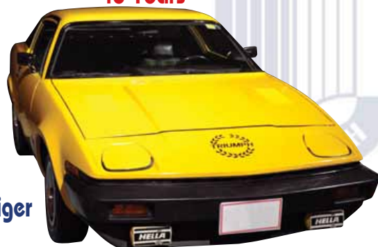
Triumph TR7 40 Years