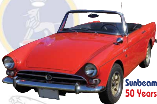
Sunbeam Tiger 50 Years