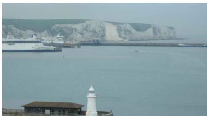
Figure 1 White Cliffs of Dover