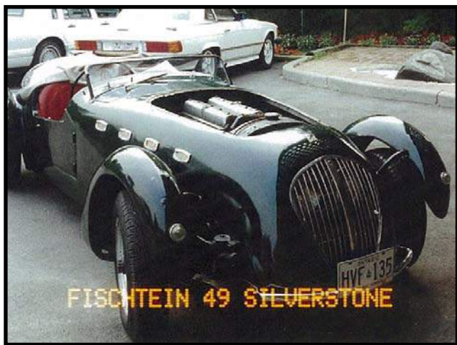
FISCHTEIN 49 SILVERSTONE