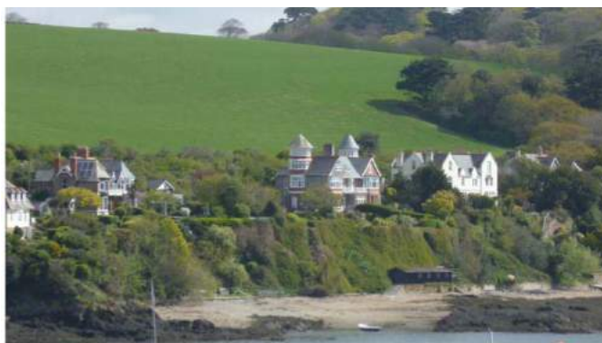
Figure 2 Falmouth (Cornwall) England