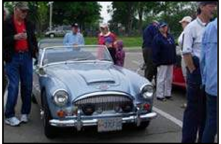
Celebrating Stage West production 2006