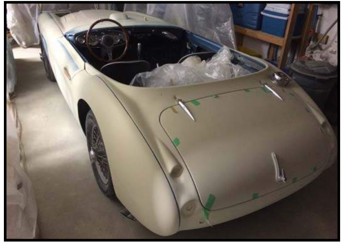
UPDATE ON PHIL'S RESTORATION PROJECT CAR - LOOKING GOOD PHIL!