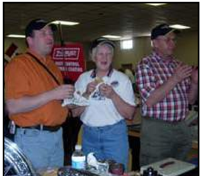
Autofarm - Marritt Hall