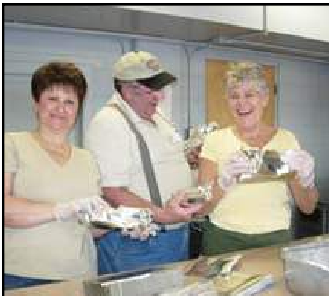
Campbell Clan in the Kitchen